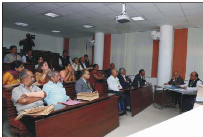
A view of the Pre-GB 3Meeting