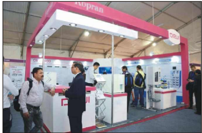
A View of the Trade exhibition