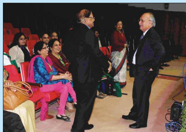
General Body Meeting : Active Members