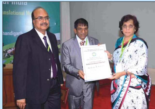
Presentation of Awadesh Saran Oration