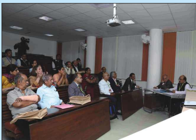
Pre-GB Executive Board Meeting