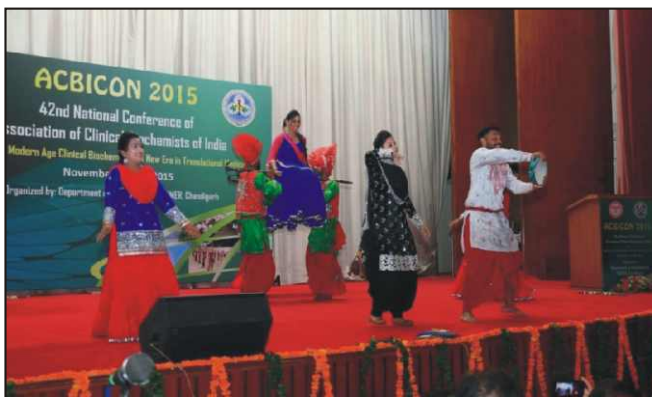
Cultural Programme : A Showcase of pure joy

the people of Punjab & Haryana. The inaugural dinner was held at the Rock Garden.