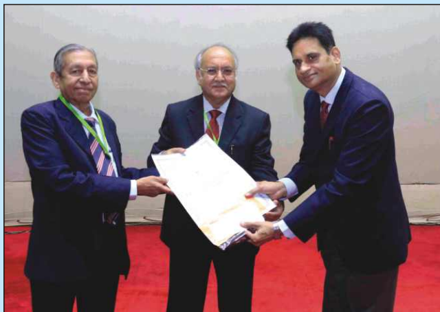
Presentation of Taranath Shetty Oration