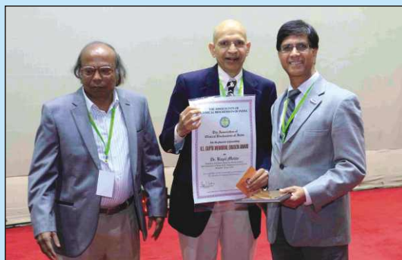
Presentation of K.L. Gupta Oration Award