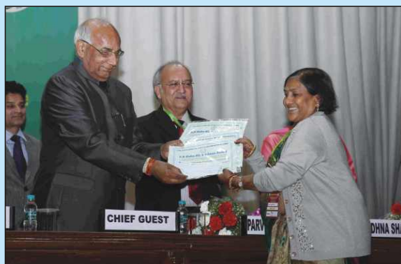
Presentation of K.P. Sinha-P.S. Krishnan Award