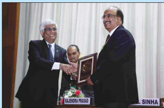
Felicitation of General Secretary, ACBI