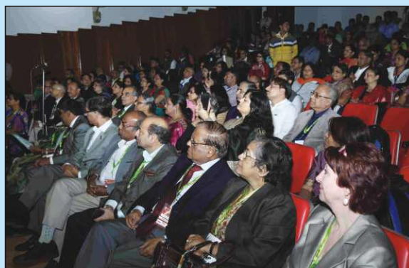
A view of the rapt audience