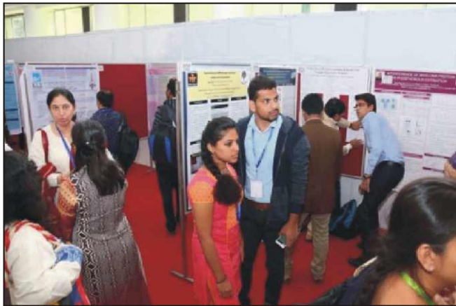
A view of the Poster Session