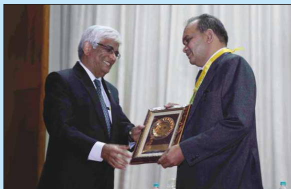
Felicitation of the Org. Secretary, ACBICON 2015