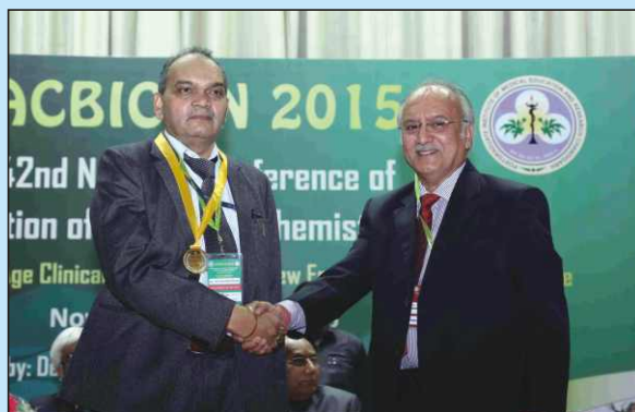
Installation of the New President