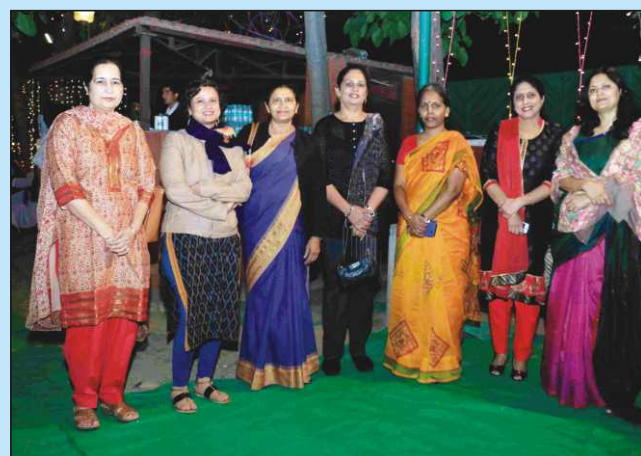
Delegates Enjoying a relaxed evening