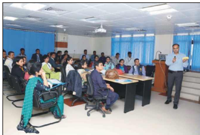
Workshops in Progress