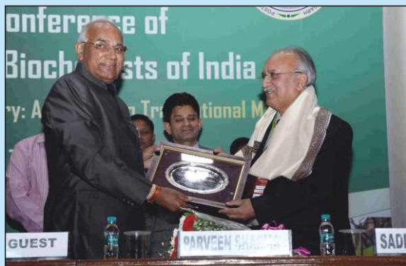
Presentation of ACBI-A.J. Thakur Award