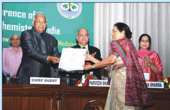
Receiving the Fellowship of ACBI